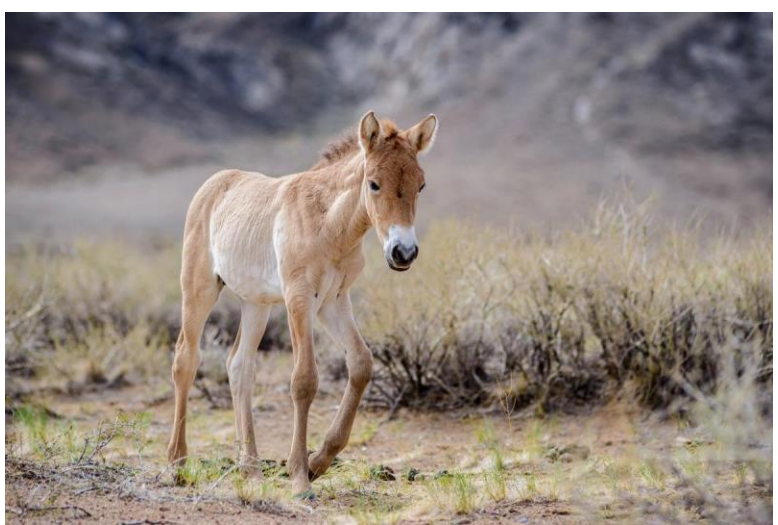
THANK YOU VERY MUCH FOR YOUR HELP!