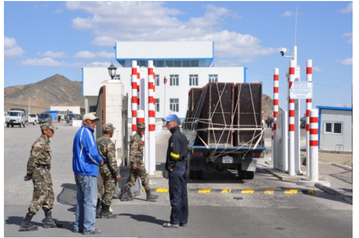
The takhis are crossing border