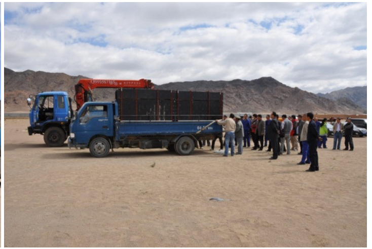
Takhis reloaded to Mongolian truck in border