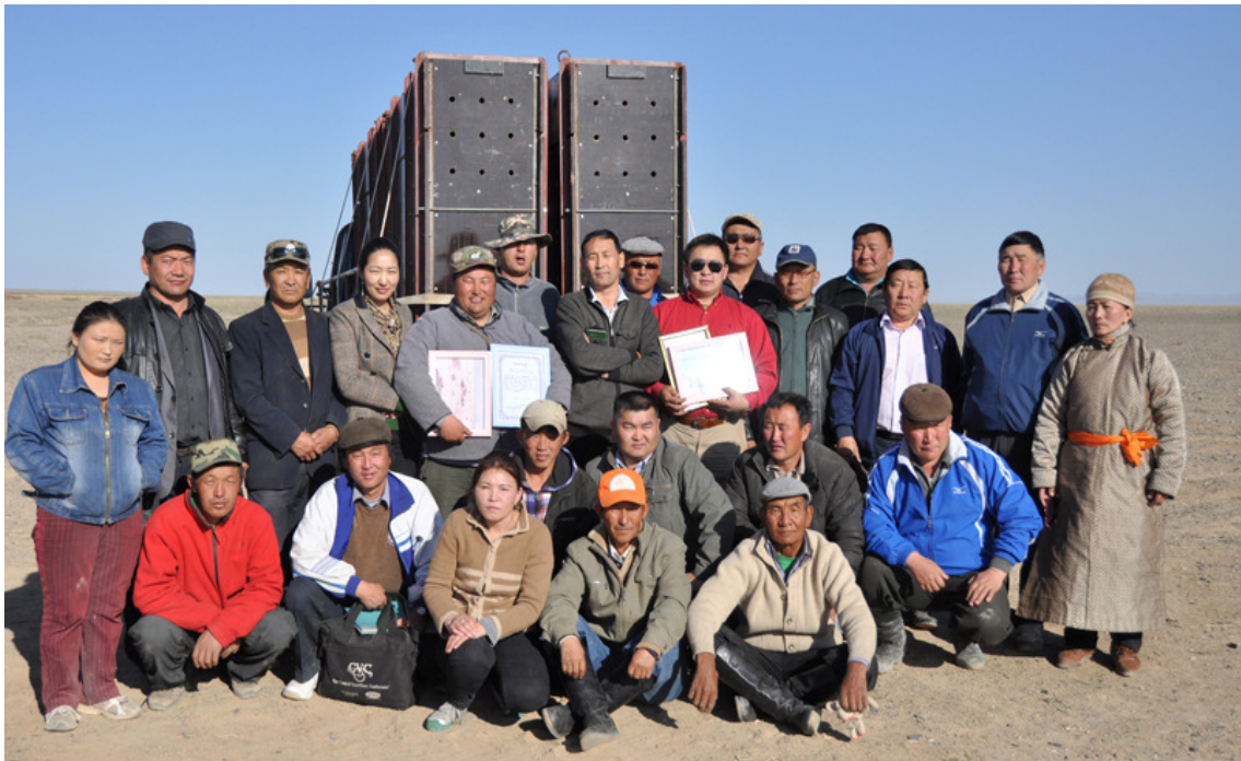
The local governors and Gobi B park administrations are happy for takhis and new cooperation with Jimsar breeding center