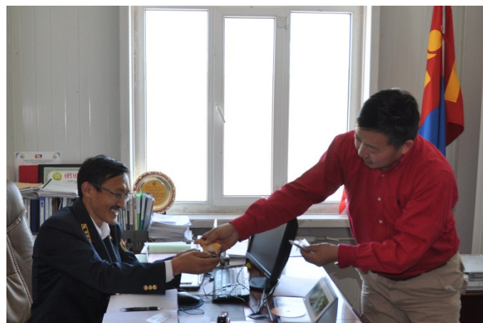
The Mongolian custom officer gets takhi souvenir of