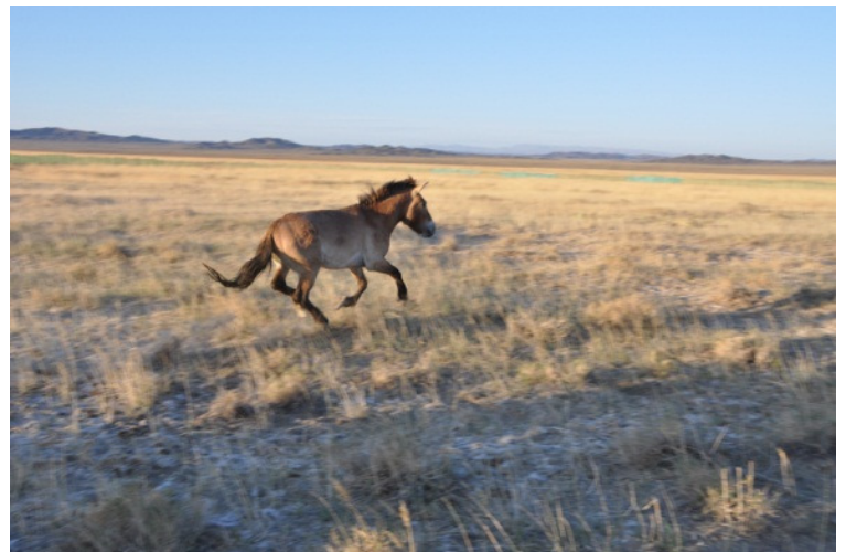
The takhis released from boxes in the enclosure at 4.30 am