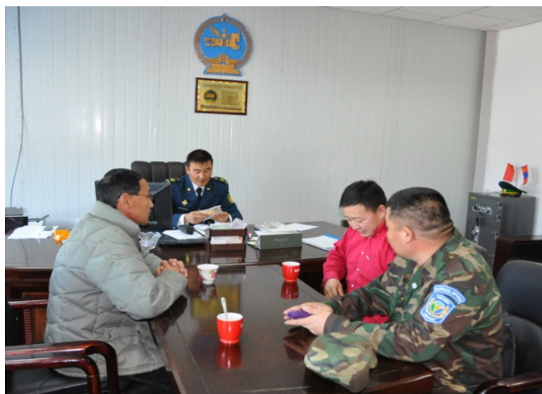
The discussion with border police