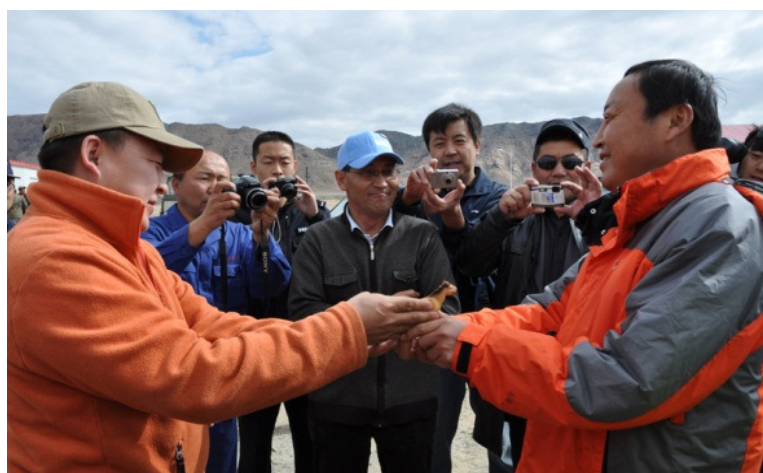
The takhi exchange with Jimsar breeding center