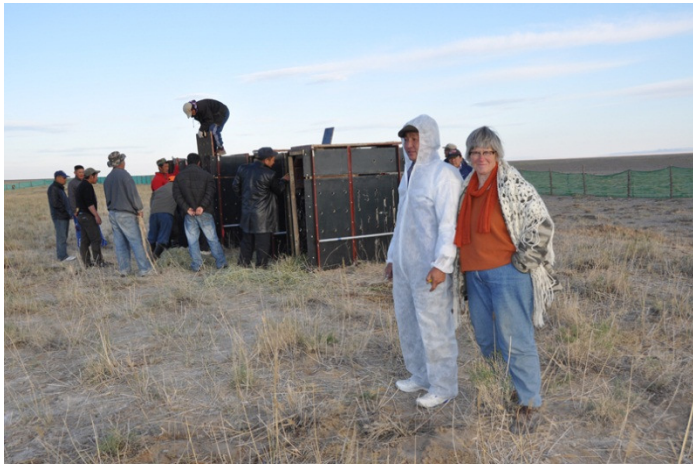
The Mongolian veterinarian checked all takhi horses in Takhi us camp