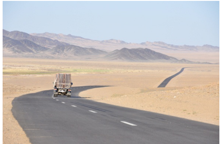
The takhis are on the way to Gobi B