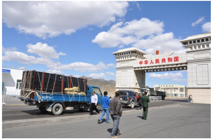
The takhis are crossing border