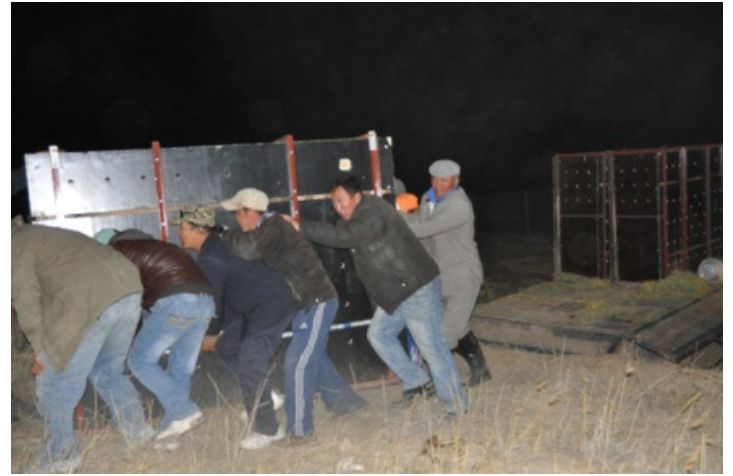
The takhis arrived in Gobi B on 1 am of 23.May 2012