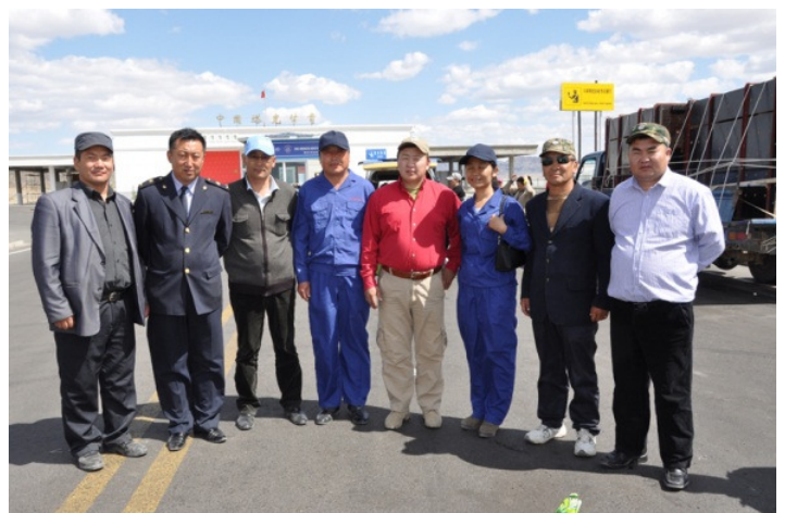
China and Mongolian team of takhi transport