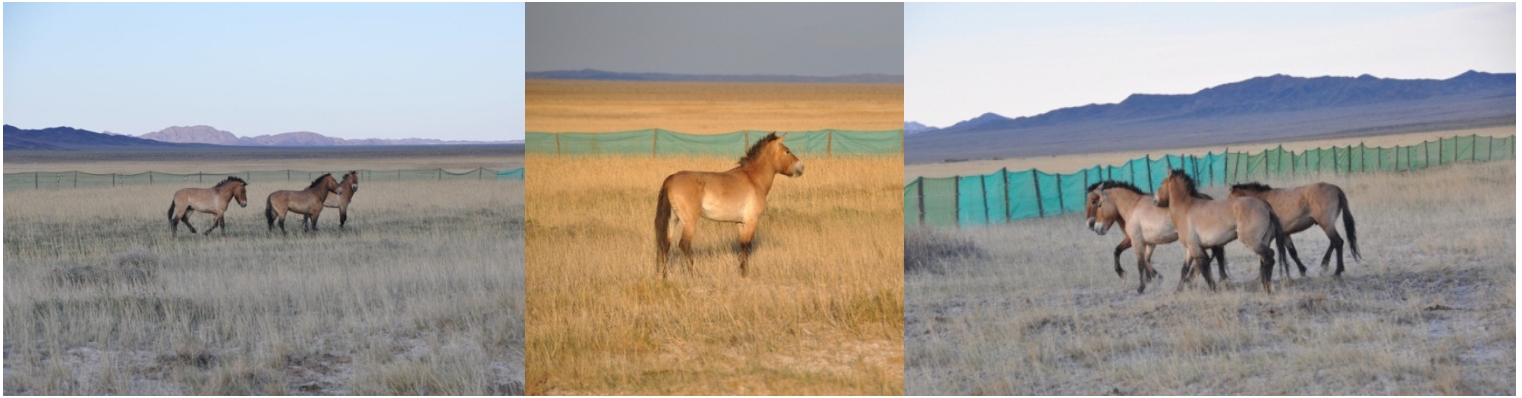
The takhis are in new place in Gobi B