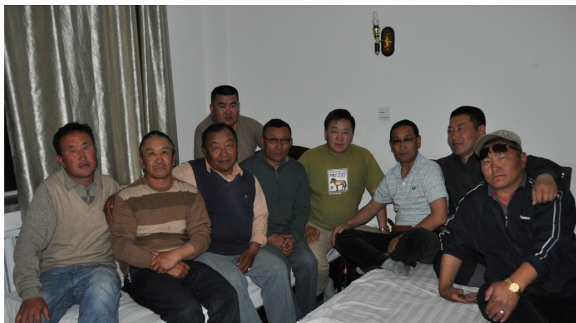
The Mongolian team of receiving the takhis