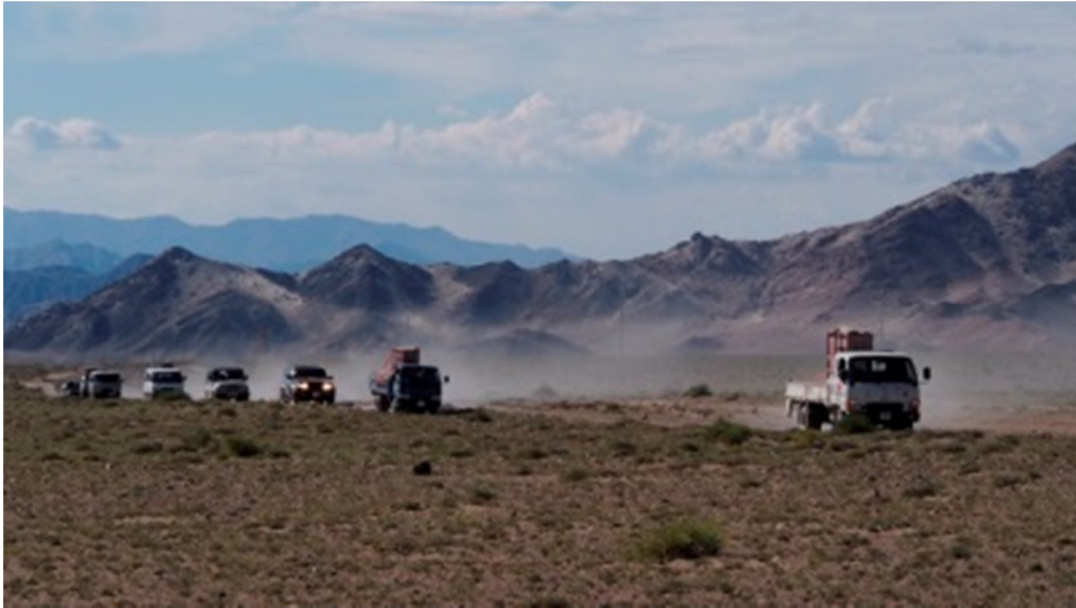
Evening after paved road