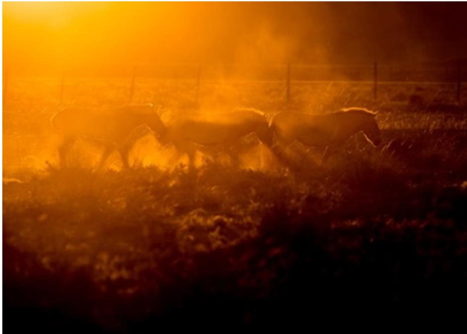
The first morning in the Gobi