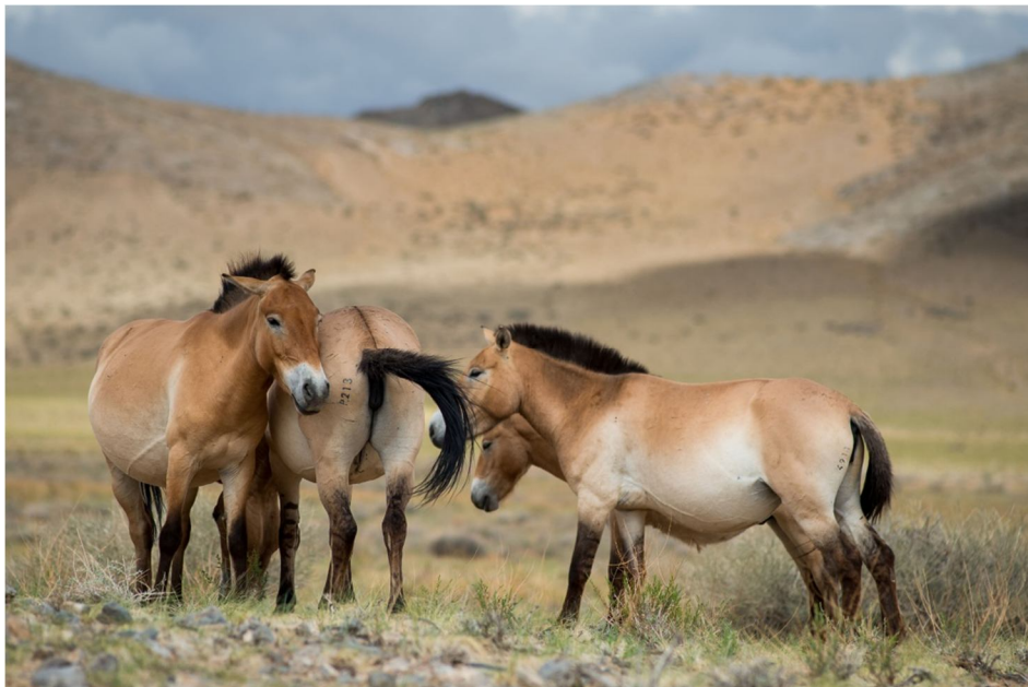
The horses of previous transport of Prague